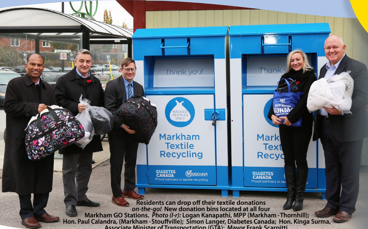
Residents can drop off their textile donations on-the-go! New donation bins located at all four Markham GO Stations. Photo (l-r): Logan Kanapathi, MPP (Markham - Thornhill); Hon. Paul Calandra, (Markham - Stouffville); Simon Langer, Diabetes Canada; Hon. Kinga Surma, Associate Minister of Transportation (GTA); Mayor Frank Scarpitti.