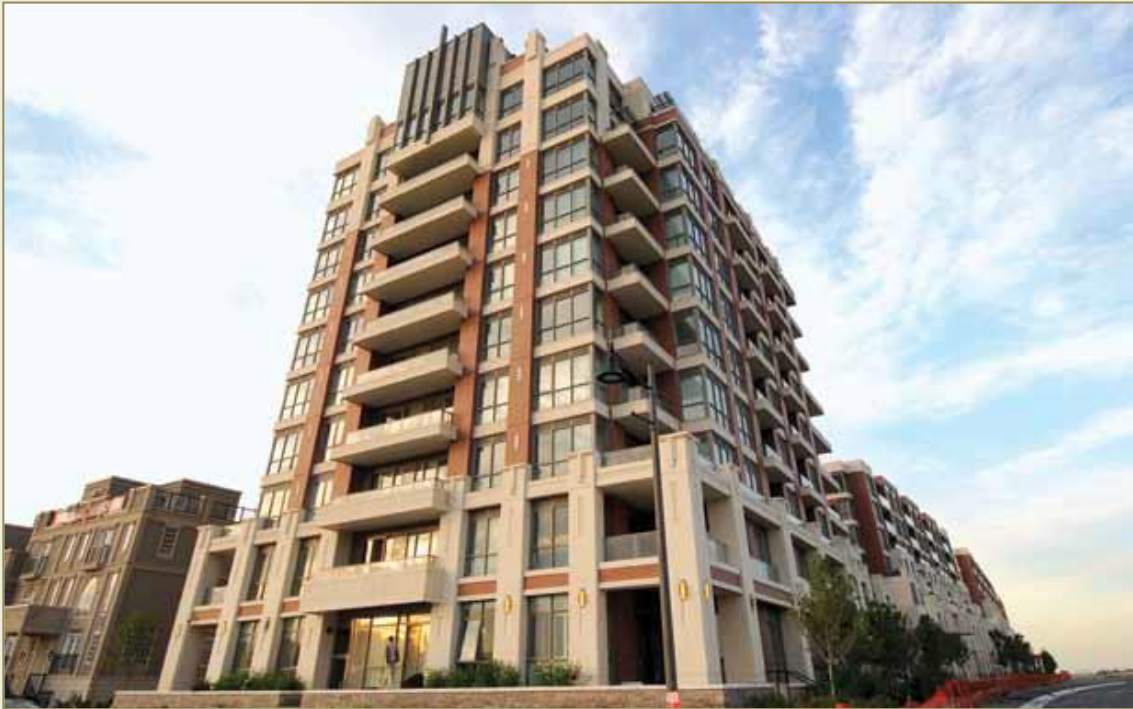
Most of Markham's new growth will be directed to intensification areas and redevelopment areas containing mixed-use, higher density development served by rapid transit.