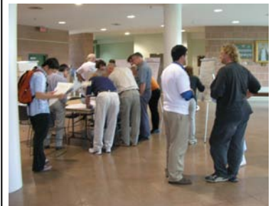
The meeting was well attended by a diverse range of Markham residents and cycling enthusiasts bringing a variety of opinions and ideas.

Chapter 4.0 defines the proposed strategy through which the Cycling Master Plan infrastructure and supporting policies will be implemented, including the Plan’s estimated cost. This chapter outlines a clear and feasible strategy for