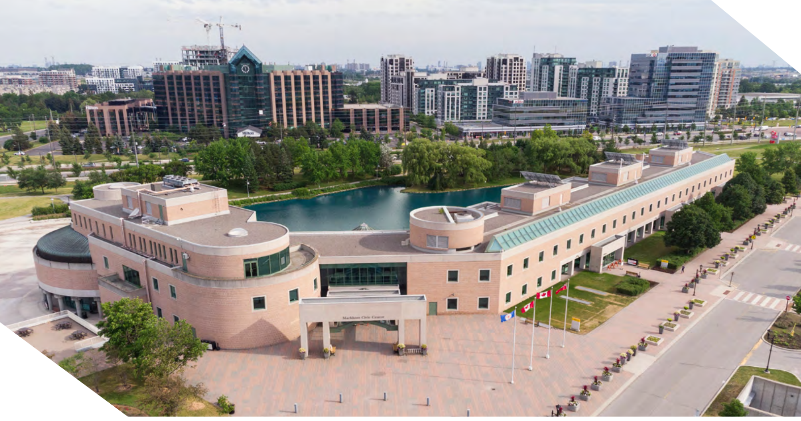
Aerial view of Markham Civic Centre summer 2022 (looking south)