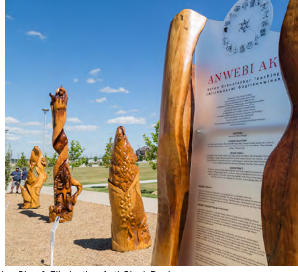
(Left) Markham-Milliken Children's Festival, (middle) Official launch of Markham's Diversity Action Plan & Eliminating Anti-Black Racism Action Plan, and Anwebi Aki Indigenous public art installation at Aaniin Community Centre (right)