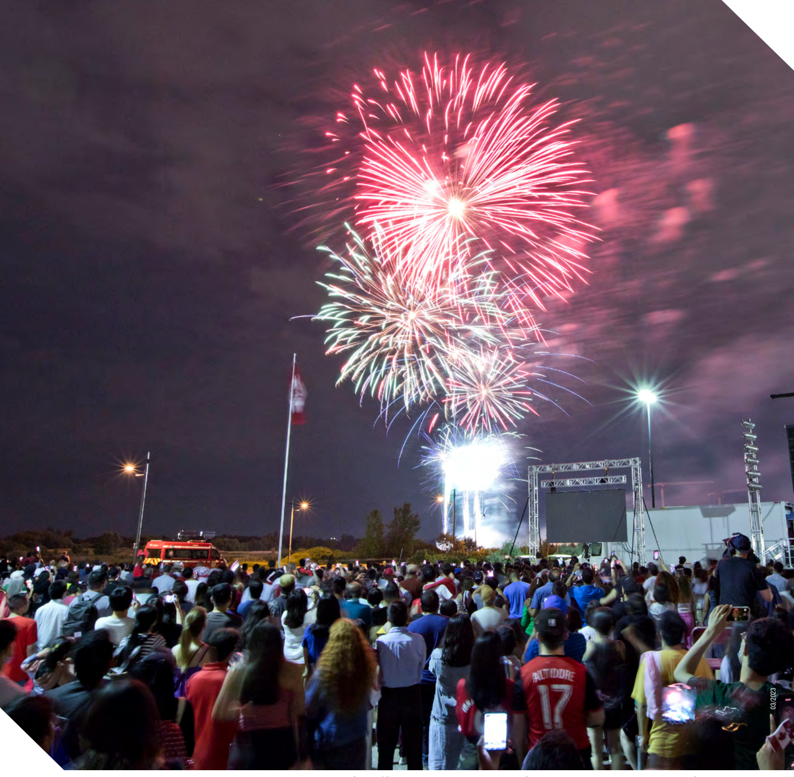
After a two-year hiatus due to the Covid-19 pandemic, residents enjoyed Canada Day celebrations at Markham Centre.