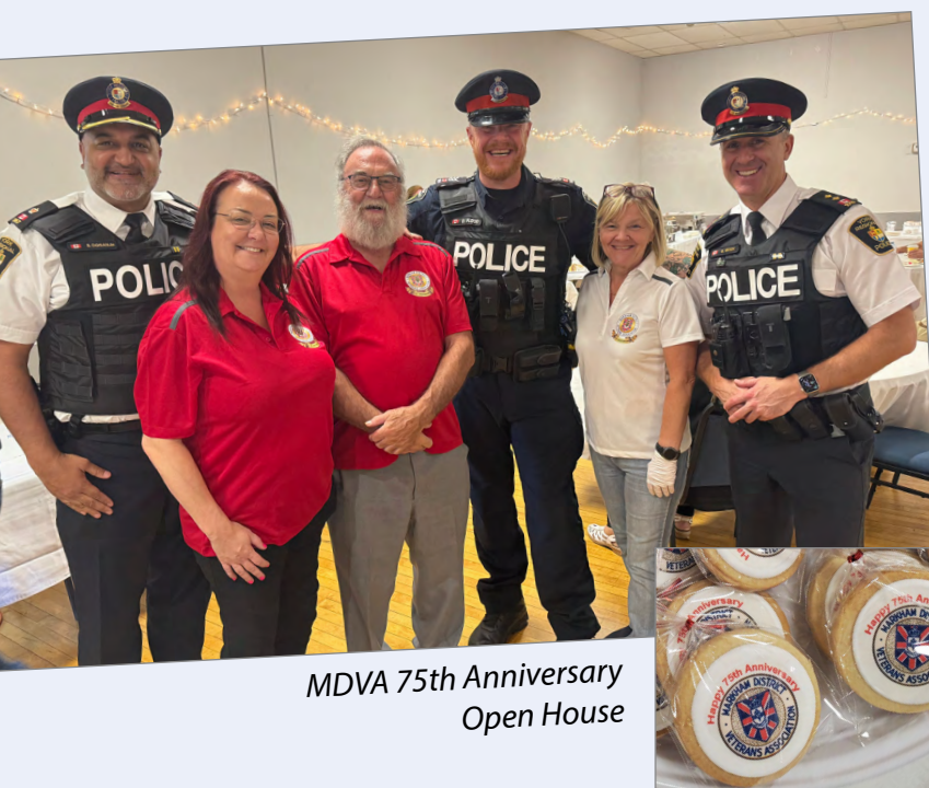
MDVA 75th Anniversary Open House