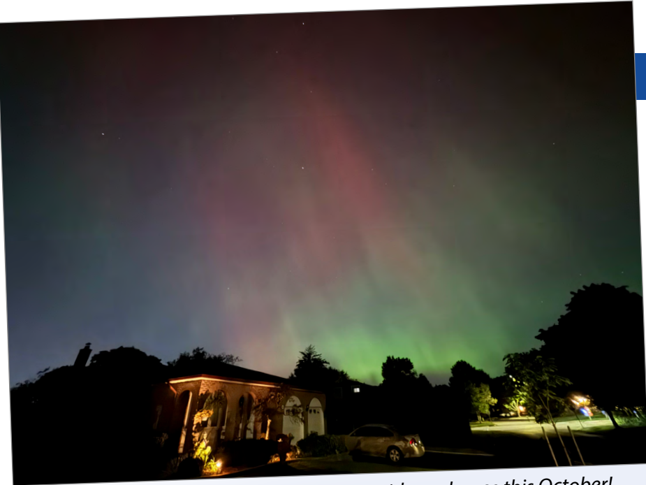
Here is a photo I captured right outside my house this October! It was an incredible sight.