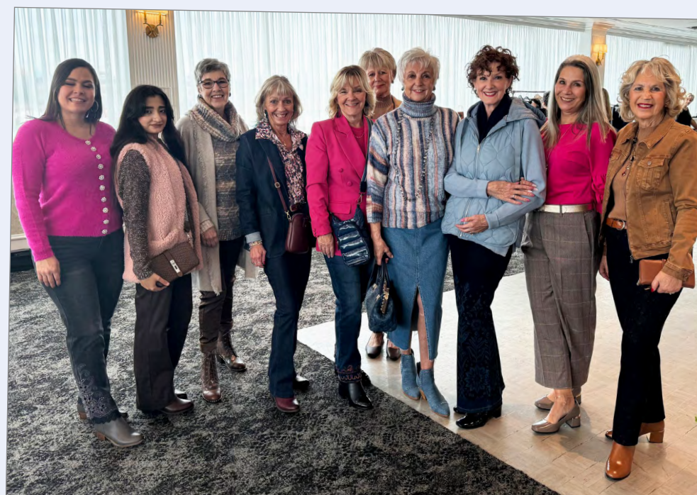
Colours of Autumn Luncheon and Fashion Show

For more information on what requires a permit and what is involved, visit markham.ca/building or contact Building Standards at 905.475.4850