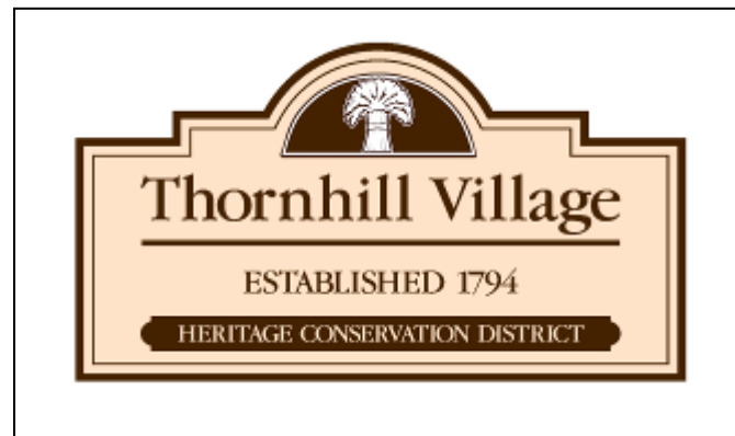
Example of Heritage District Entry Sign (above) and Street Signs below.